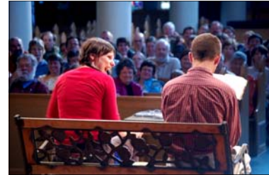
'Well ...' in Performance

Throughout 2006 and 2007 I toured my play 'Well...' through the Okanagan, Lower Mainland, Vancouver Island and the Sunshine Coast. Sharing my experiences and friends in Ghana with audiences around BC was a privilege, constantly reconnecting me to that transformational experience. Through the characters of Peter and Angela, and by showing pictures from the villages, explaining the water conditions, and repeatedly receiving generous donations, the transfor-