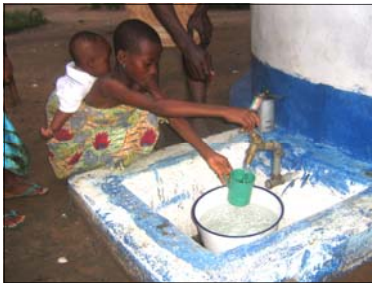
One of the tanks in use