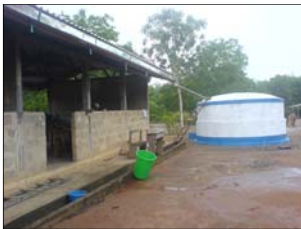
Rainwater Collection and Tank

Phase 1 was completed in fall 2007, consisting of one small rainwater harvesting tank (10,000 liters) in each of the two villages and two large tanks (75,000 liters each) at the shared school.