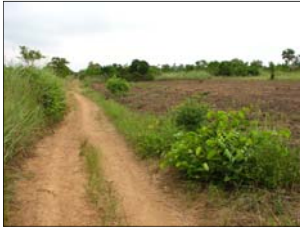
The Road to Adexor